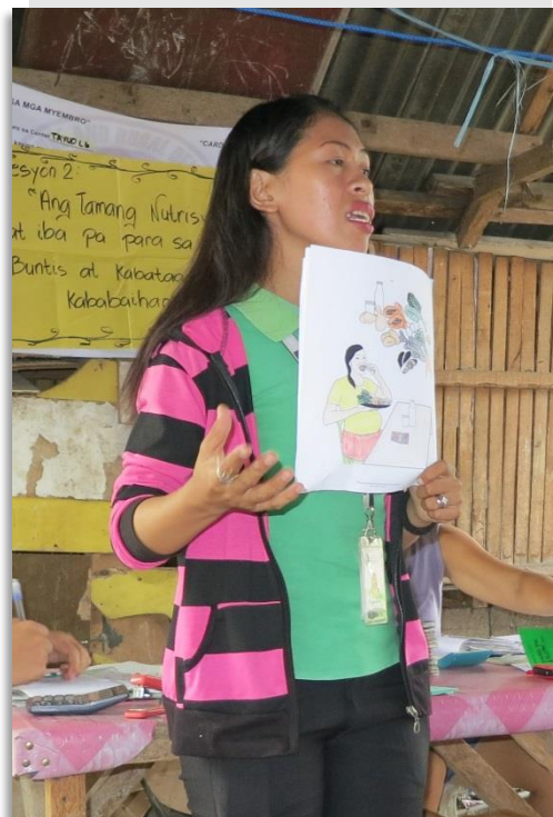
CARD members enjoying the PLC

A CARD Account Officer delivers the “Healthy Pregnancies Make Healthy Communities” Pictorial Learning Conversations